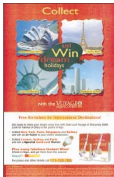
An advertisement for Gold Leaf cigarettes in a Pakistani newspaper, linked to the "Voyage of Discovery" and related promotional activities by BAT.

Second, this time the publicity surrounding the event was not all one sided. Certainly BAT's gift of Rs4.5 million (US$77 000) to Radio Pakistan for a live broadcast of the climax of the visit, a concert for young people at the city's most prestigious yacht club, helped to generate favourable publicity. However, several newspapers and other media gave detailed coverage to the health arguments against the visit, and a multidisciplinary doctors' group addressed a major press conference. BAT even felt obliged to trot out the almost irrelevant assurance that it would exclude under-18s from the big event (thereby making it even more attractive to the young).