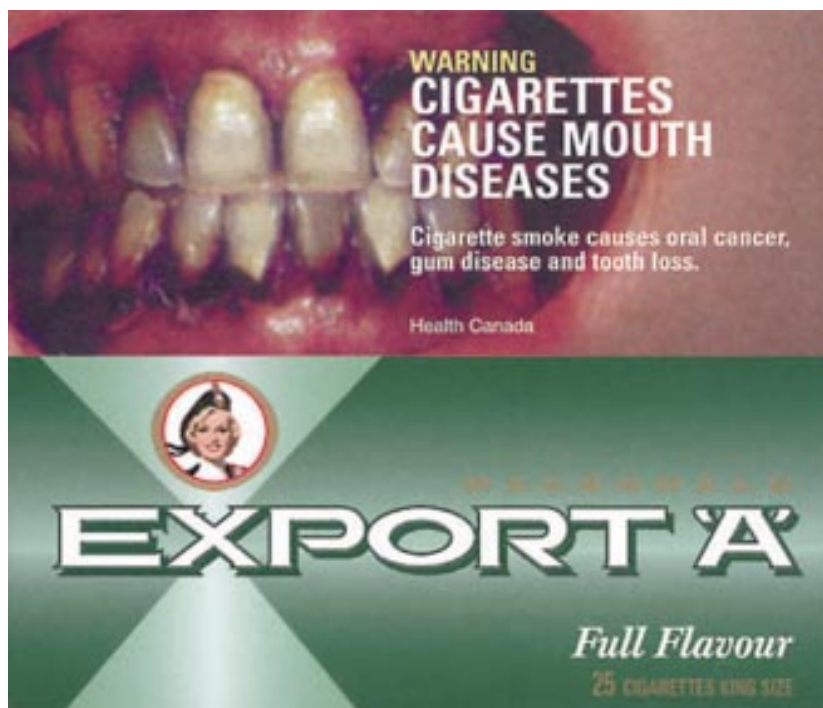
A mock up package with one of the new exterior warning (left) and one of the package inserts (right).

On the side of the package, a range of yields of tar, nicotine, carbon monoxide, formaldehyde, hydrogen cyanide and benzene must be displayed. The lower end of the range is based on the ISO test method, with the upper end based on a modified ISO method