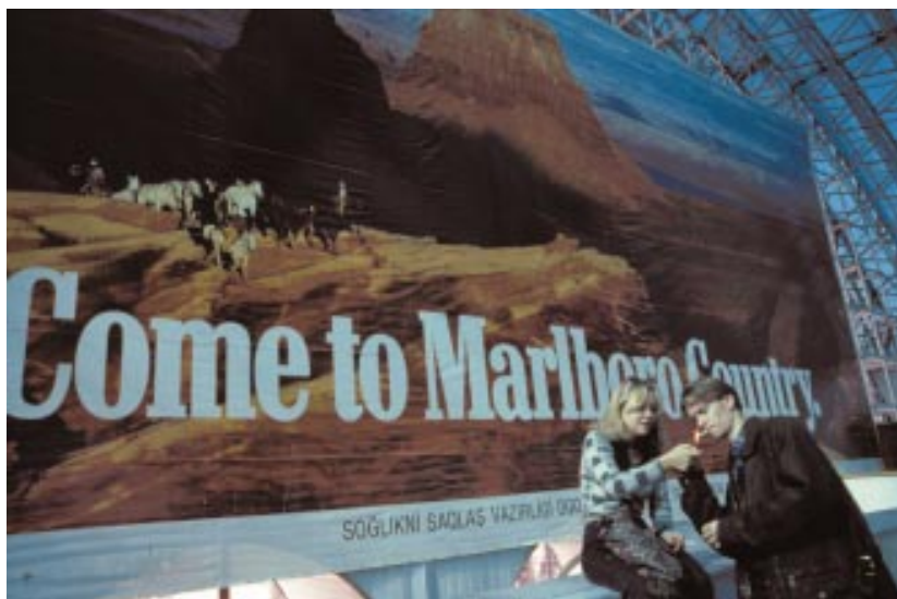
Cigarette advertising in Tashkent, Uzbekistan.

True, the country passed a tobacco control law, but it was never implemented. Admittedly, when tobacco control experts from the World Health Organization were due to arrive in 1997, the health ministry reckoned it had better have a tobacco programmes coordinator, so it appointed one, a busy cardiologist. He did his best, which was better than the nothing the ministry had done before, but in fairness, having no salary for the extra job thrust upon him, and no budget to spend, it was clear from the outset that there was little he could achieve. When he stepped down from the role (though diligently continuing his anti-tobacco efforts in his clinical work), a successor was appointed, but still without salary or budget. When the monthly salary required to fill such a post is probably less than a tobacco company pays to fill the fuel tank of just one of its promotional vehicles—US$15–20 per month—is it really beyond the reach of the government to spend such a sum on starting to tackle the country's tobacco problem?