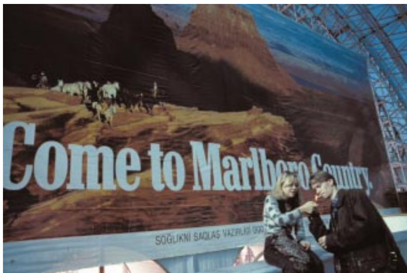
Cigarette advertising in Tashkent, Uzbekistan.

True, the country passed a tobacco control law, but it was never implemented. Admittedly, when tobacco control experts from the World Health Organization were due to arrive in 1997, the health ministry reckoned it had better have a tobacco programmes coordinator, so it appointed one, a busy cardiologist. He did his best, which was better than the nothing the ministry had done before, but in fairness, having no salary for the extra job thrust upon him, and no budget to spend, it was clear from the outset that there was little he could achieve. When he stepped down from the role (though diligently continuing his anti-tobacco efforts in his clinical work), a successor was appointed, but still without salary or budget. When the monthly salary required to fill such a post is probably less than a tobacco company pays to fill the fuel tank of just one of its promotional vehicles—US$15–20 per month—is it really beyond the reach of the government to spend such a sum on starting to tackle the country's tobacco problem?