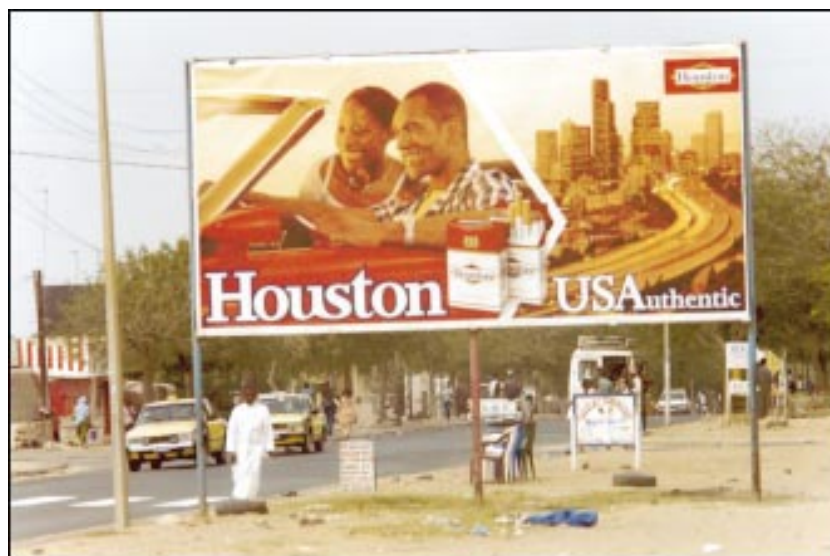
Sénégal : a billboard forming part of the launch of Houston brand in the summer. Multimedia advertising included a fleet of all terrain vehicles servicing promotional events. As with other cigarette promotion in the country, American associations are central to the brand's image. A much repeated radio advertisement, to a background of rock music, said: “This taste, this force, this cigarette . . . Houston, USA authentic.” The launch was held in May and June. The summer school holidays begin in June.

Mathew Arnold's classic narrative poem Sohrab and Rostum ends by following the course of the Oxus river, beside which Rostum has unwittingly killed his long lost son in a duel of champions from opposing armies. The poem ends as the river struggles through miles of obstructions, “till at last/ The long'd-for dash of waves is heard, and wide/ His luminous home of waters opens, bright/ And tranquil, from whose floor the new-bathed stars/ Emerge, and shine upon the Aral Sea.” The Soviet Union so abused the Aral and diverted its tributaries, and allowed massive amounts of industrial pollution to end up in it, that it is now just a vast, dry, toxic