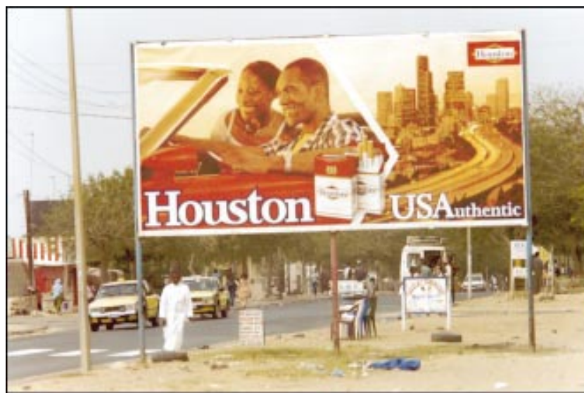
Sénégal : a billboard forming part of the launch of Houston brand in the summer. Multimedia advertising included a fleet of all terrain vehicles servicing promotional events. As with other cigarette promotion in the country, American associations are central to the brand's image. A much repeated radio advertisement, to a background of rock music, said: “This taste, this force, this cigarette . . . Houston, USA authentic.” The launch was held in May and June. The summer school holidays begin in June.

Mathew Arnold's classic narrative poem Sohrab and Rustum ends by following the course of the Oxus river, beside which Rustum has unwittingly killed his long lost son in a duel of champions from opposing armies. The poem ends as the river struggles through miles of obstructions, “till at last/ The long'd-for dash of waves is heard, and wide/ His luminous home of waters opens, bright/ And tranquil, from whose floor the new-bathed stars/ Emerge, and shine upon the Aral Sea.” The Soviet Union so abused the Aral and diverted its tributaries, and allowed massive amounts of industrial pollution to end up in it, that it is now just a vast, dry, toxic