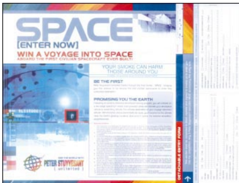
South Africa: an entry form for the Peter Stuyvesant "Spaceflight" competition run during 2000. All entrants, who had to submit bar codes from three packs of the sponsor's cigarettes, were entitled to win a cigarette lighter and a place in a weekly draw for a Palm 111c palmtop computer. The overall winner is to be given a place on the first commercial space voyage, target date 2003. It is thought the flight will be strictly non-smoking.

to take into account smoker compensation. Requiring a range of yields is a world first, as is requiring yields for six substances.