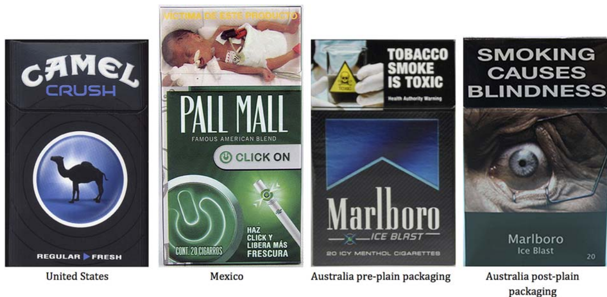
Figure 1 Example packages of brand varieties with flavour capsules in the USA, Mexico and Australia, 2014.

Brands were also classified into discount or premium price segments. For Mexico, national brands were classified as discount and international brands as premium, except for Pall Mall, as in prior research. 27 28 For the USA, we classified brands using a scheme developed in prior research that considered price and advertising image, 31 because both are critical to how the tobacco industry itself promotes premium brands. As such, this coding scheme involved assessment of pricing and tobacco industry representations of brands on industry websites and trade publications. Analyses by price segment were not