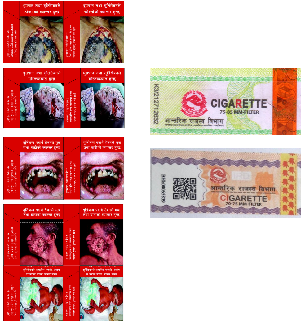
Figure 1 Cigarette packs with 5 different Health Warnings (left) and Authentic excise sticker with Nepal Government Logo and security measure (right)