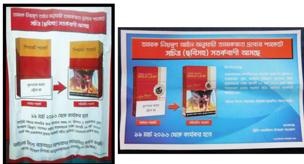
Figure 3 Posters circulated by the Bangladesh Cigarette Manufacturers' Association and British American Tobacco Bangladesh on 12 March 2016. 53T

Tobacco control advocates closely monitored the entire process and repeatedly voiced concerns about the delay and weakening of the policy and the industry influence on the process. 56 For example, Saber Hossain Chowdhury MP, then chairman of the Inter-Parliamentary Union and convenor of Tamakmukto