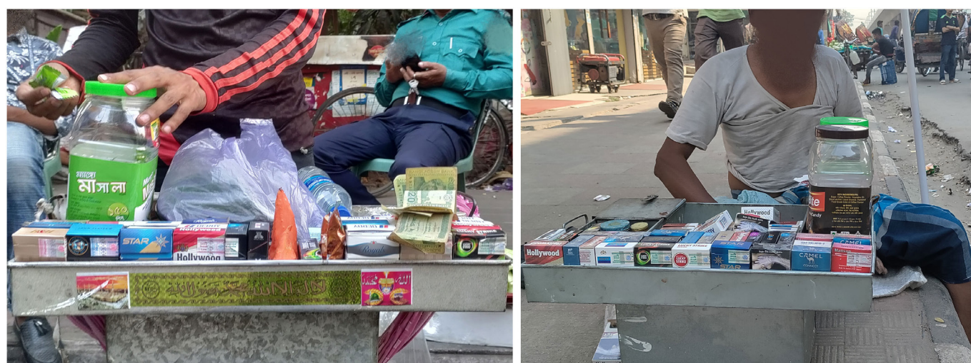
Figure 1 Mobile sellers offering cigarette packs in steel trays. 53

This study draws primarily on media articles, an important data source for researchers across disciplines, 30 31 including tobacco