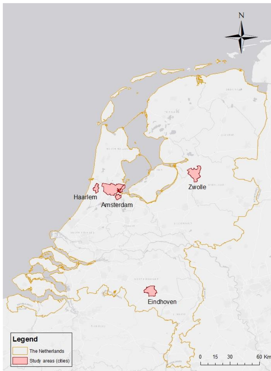
Supplementary Figure 1. Map of the Netherlands highlighting the location of the four included cities.