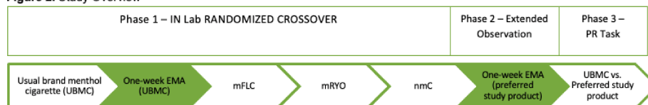
Figure 2. Study Overview

Figure 2 depicts the sequence of the proposed study. Using an in-laboratory and ad libitum outpatient mixed design, 80 current menthol cigarette smokers will complete a three phase, 3-week study. Over the 3-week study time period, participants will attend 5